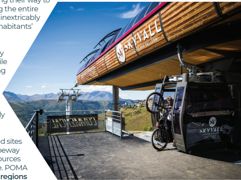
SKYVALL Valley Lift - Loudenvielle - FRANCE - 2019

Similarly, the ropeways connecting a resort's different levels and sites meet peri-urban mobility needs. Through its experience in ropeway transportation, in particular in urban areas, POMA has the resources to design particularly silent ropeways suitable for intensive use. POMA is therefore a privileged partner when it comes to supporting regions throughout all the phases of their mobility planning and design. In addition to building and installing valley lifts, POMA offers a host of related services, such as innovative predictive maintenance solutions and the integration of a concierge service for luggage and skis.